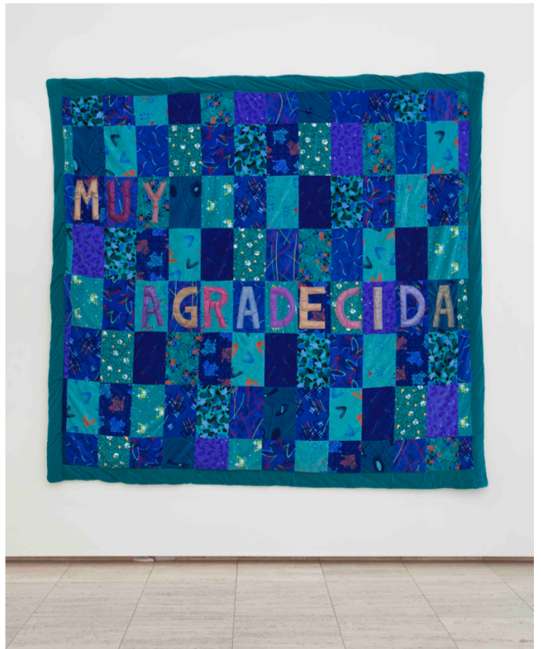
Noor Nuyten, Measured Through a Screen the Sea is 4 Cm , 2019, Photoprint on acrylglass and aludibond, handmade ceramics, courtesy of Upstream Gallery Amsterdam Ana Navas, Muy Agradecida , 2018, fabric, a.o. fabric used for seats in busses, 272 x 295 cm, courtesy tegenboschvanvreden, Amsterdam