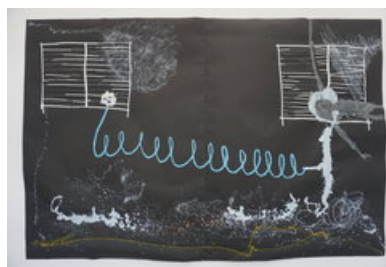
Thierry Oussou Lumen Travo Galerie Unitile 2020 203 x 301 cm