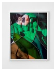
Vytautas Kumža Galerie Martin van Zomeren Fingertip (2021) Ink-jet print on archival paper, stained glass, lead, aluminium frame, 50 x 40 cm