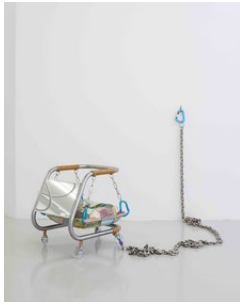
Gas 9 Gallery Maiben Bent, Fixtures, 2022