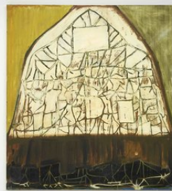
Pizza Gallery Jonas Dehnen, Bessel (map with two skies), 2022